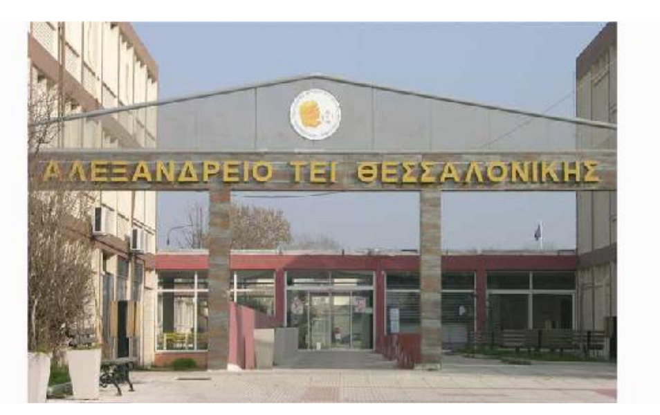
Figure 1. View of the Envrionmental Engineering Department's Building